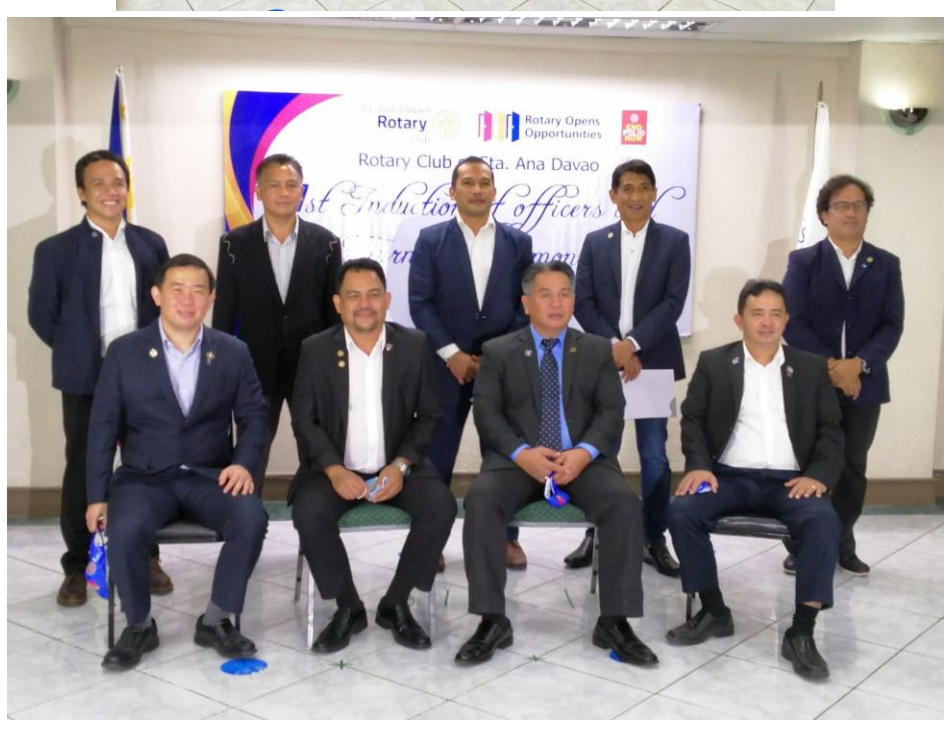
The Rotary Club of Sta. Ana (Davao) family